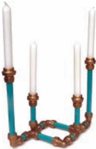
Above – candelabra by Nick Fraser from the Pipeworks Series at the Christmas Design Fair

1-24 December; 10am-4pm, Monday-Friday Dickensian Fair at Leadenhall Market off Leadenhall Street EC3V 1LR As well as the shops, restaurants and cafés in this undercover Victorian marketplace, a host of stalls will be setting up along its cobbled streets for a daily Christmas market on a Dickensian theme. Great for gift ideas and those difficult-to-find-presents. FREE www.leadenhallmarket.co.uk