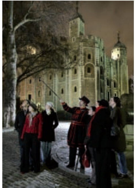
Above – Tower Twilight Tours at Tower of London

If you can't make one of these guided tours, why not take our self-guided Dickens walk? Created in collaboration with the Dickens Museum, it will lead you on a fascinating tour of the atmospheric London haunts which provided the famous scribe with inspiration. Pick up a leaflet from the City Information Centre, any of the City libraries or the Dickens Museum.